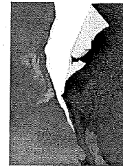
ILLUSTRATION BY CHRISTOPH NIEMANN; MAP BY ZIGGYMAJ / GETTY

The next full-margin rupture of the Cascadia subduction zone will spell the worst natural disaster in the history of the continent.